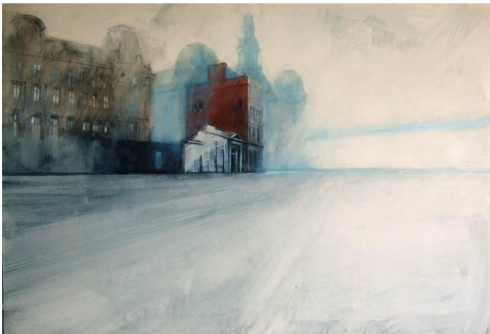
The finished painting