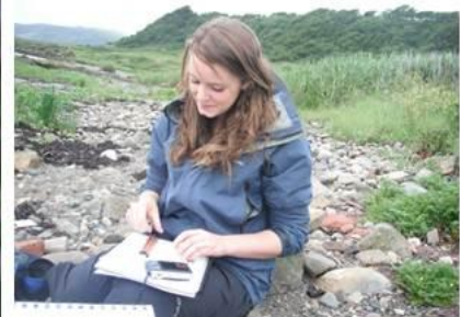
And yes it was dry enough at times to draw outside!