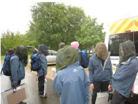
Fighting the midges and the rain with the outdoor centre's gear.

The trip was based at the Arran outdoor education centre. The centre provided us with accommodation and meals and also travel around the island. We were accompanied by outdoor centre staff who took us to suitable locations around the island where we were able to draw and take photos.