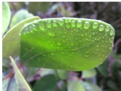
We made the most of the weather, collecting Some excellent images of raindrops.